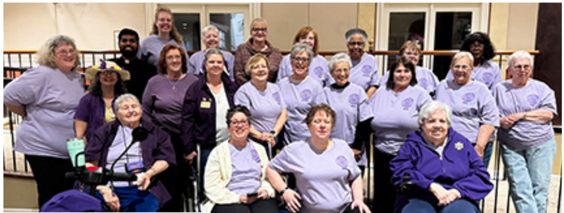
Delegation from Philadelphia sporting their T-shirts— Philly Catholic Daughters: Strong in Faith, United to Win!