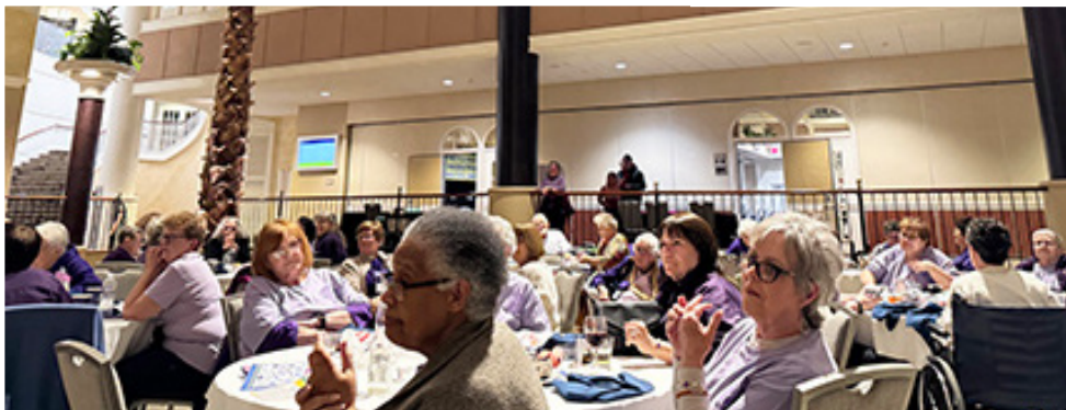
Members dancing and enjoying good music of our time