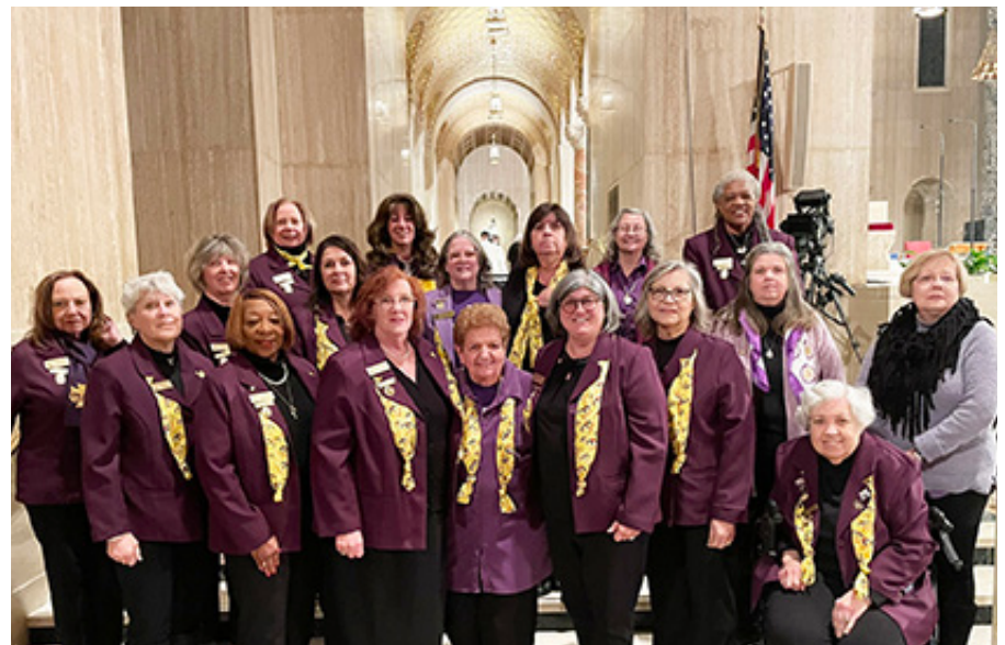
CDA members attend Pro Life Mass