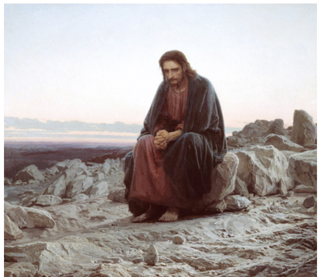
Christ in the Desert Ivan Kramskoi 1837 - 1887 RestoredTraditions.com

In this way, you create an open and receptive space: a fertile soil that God can transform. As you embrace the mystery of Lent, may you experience a profound renewal: a deeper peace, a steadfast hope, a burning love. For in opening yourself to God, you will discover that He is the one your heart was made for all along. May this be a holy and transformative Lent: a time of returning to the One who is returning to you, now and forever. Amen.