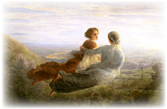
The Soul's Flight

Louis Jannot 1814-1892; RestoredTraditions.com